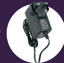
Hitron power supply